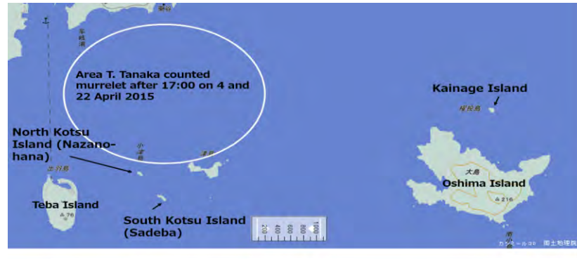
Figure 3. Map of Kotsu Island and Kainage Island in Tokushima Prefecture

There is ferry service between Mugi-cho and Teba Island, Tokushima. On the ferry route, T. Tanaka counted 150-200 murrelets on 4 April and 200-300 murrelets on 22 April 2015, after 17:00 (pers. comm.) Tanaka counted in the circled area in Fig. 3. According to the Tokushima Shimbun web site (2017), T. Harada said that more than 400 murrelets are visible in the water in the evening if weather and sea conditions are good. However, no detailed description of distribution was available in the article. The Tokushima red list says there should be fewer than 1000 adults in Tokushima (Tokushima Prefecture 2010). Murrelets are observed off the coast of the southern part of the prefecture, such as Mugi-cho (Tokushima Prefecture 2001).