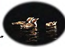
Figure 4. Departing family of Japanese Murrelets during the spotlight survey around Okinoshima Island on 26 April 2014. The line is the survey route. (Japanese Murrelet photo: M. Takeishi)

BIRO ISLAND (Kochi Prefecture, Zone 3): This island is located 2.5 km southwest from Kojima, Kochi prefecture, Japan. According to S. Sato, he and his colleagues conducted spotlight surveys on 21 March 2015. They recorded 10 murrelets around the island. Timing of the survey was slightly early; more murrelets are likely to have been counted in April (S. Sato pers. comm.).