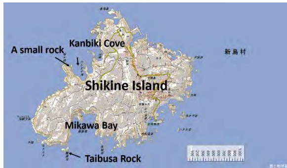
Figure 2. Map of historical Japanese Murrelet colony

Shikine Island with Taibusa Rock : Shikine Island (Figure 2) is located 3 km southwest from the south end of Niijima Island. It has about 530 inhabitants. Taibusa Rock is located 1km from the west edge of Mikawa Bay.